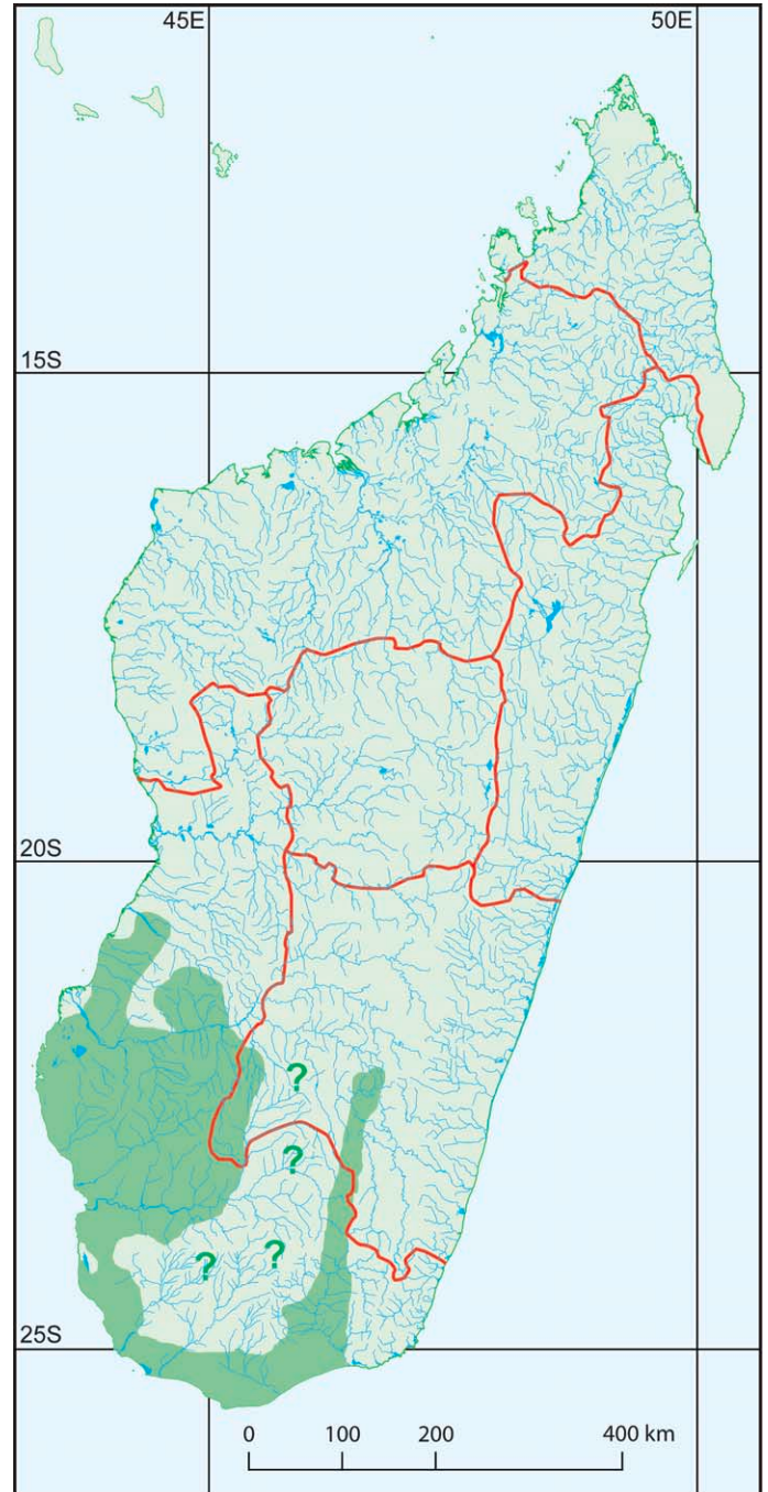
Fig. 3.—Distribution of Lemur catta .

The peculiar vulpine aspect of the head of L. catta is not so much due to an elongation of the muzzle as to the retention of a moist, glandular rhinarium and the upper jaw supporting it projecting beyond the level of the chin. The naked rhinarium continues down in front as a strip of grooved, naked skin that cleaves the upper lip. The upper lip adheres to the premaxillae, making it incapable of protrud-