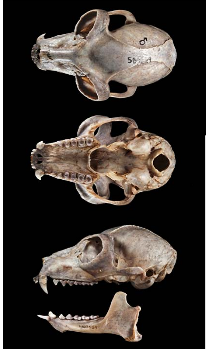
Fig. 2. —Dorsal, ventral, and lateral views of the skull and lateral view of the lower mandible of Lemur catta (adult male, United States National Museum no. 589559), collector and locality unknown.

The body of L. catta is covered with dense, gray to gray-brown pelage, slightly darker around head and neck, with the exception of the ventral side and face. The underside, throat, and face are lightly haired with a paler, off-white color that allows darker skin to show beneath. The eyes are accentuated by conspicuous black, triangular rings around them, contrasting sharply with the white interocular area (Garbutt 1999; Jolly 1966; Mittermeier et al. 2006; Tattersall 1982). The ears are large and well furred, but without tufts. There is no obvious body color difference between males and females but variation may exist between individuals in the facial region (Jolly 1966). Dorsally, they are warm rosy brown grading into pale gray or grayish brown on the rump,